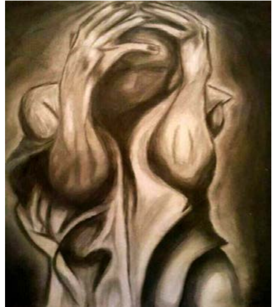
Crestfallen 30x21 cm Dry pastels

The concept behind the artwork shows the darkness and horror of life. It shows how we all need to find our light and embrace ourselves while accepting ourselves and our darkness. Keeping the bad thoughts locked inside the mind and showering the world with positive thoughts. At the end he won against the darkness.