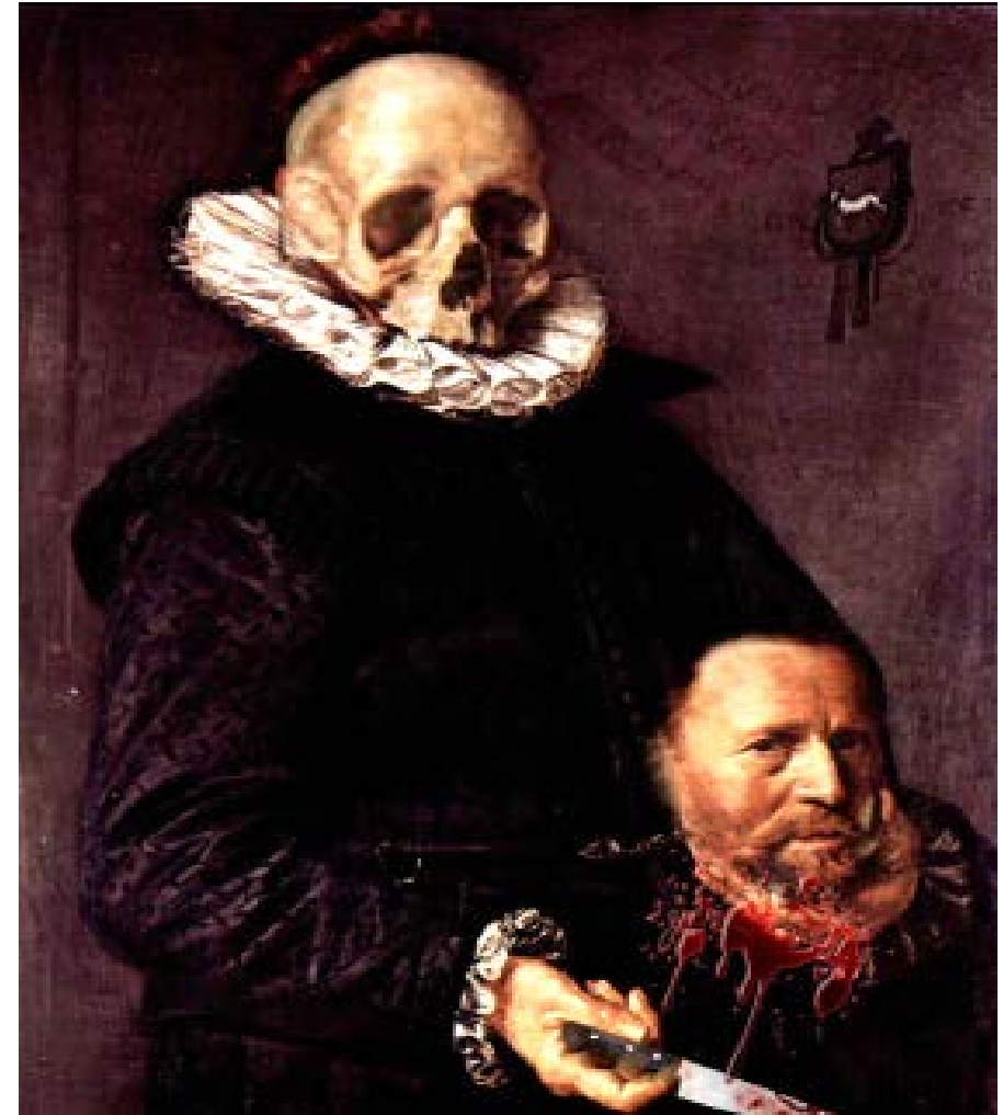
To Be or Not to Be 30x21 cm Digital art

The inspiration for this artwork is Shakespeare's play Hamlet. It illustrates a reverse role whereas instead of the man holding the skull in his arms, the skull holds the man's head. Thus, that shows how actions have consequences and that one's decision will affect others around them and in return will reflect towards them.