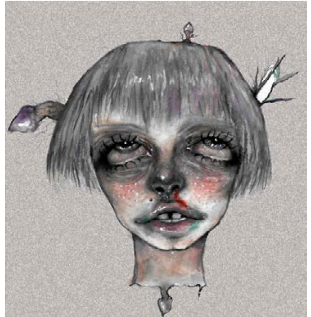
Shades of silence 1

My art is mostly inspired by my emotions and my experience in life, my point in my art is not that, all art is sad, but that melancholy is a sign. A call to something more. I think maybe my art and my way of expressing my emotions moves us closer to the truth. And those who are willing to be honest and vulnerable are the voices with something to say. Why not do something today to remind yourself and the rest of the world that you're not finished (none of us are). There's still healing and wholeness to happen. Still stuff that needs fixing. After all, this is the difference between a message that rings hollow and one that hits home.