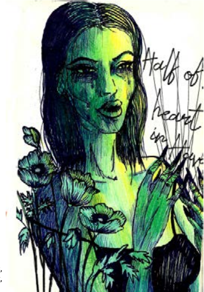
Sorrow 20x13 cm Color pencils, highlighter, ink, pen.

Eva is an insecure girl who holds jealousy in her eyes, everything around her seems blue and boring she seeks nothing but to be complete.