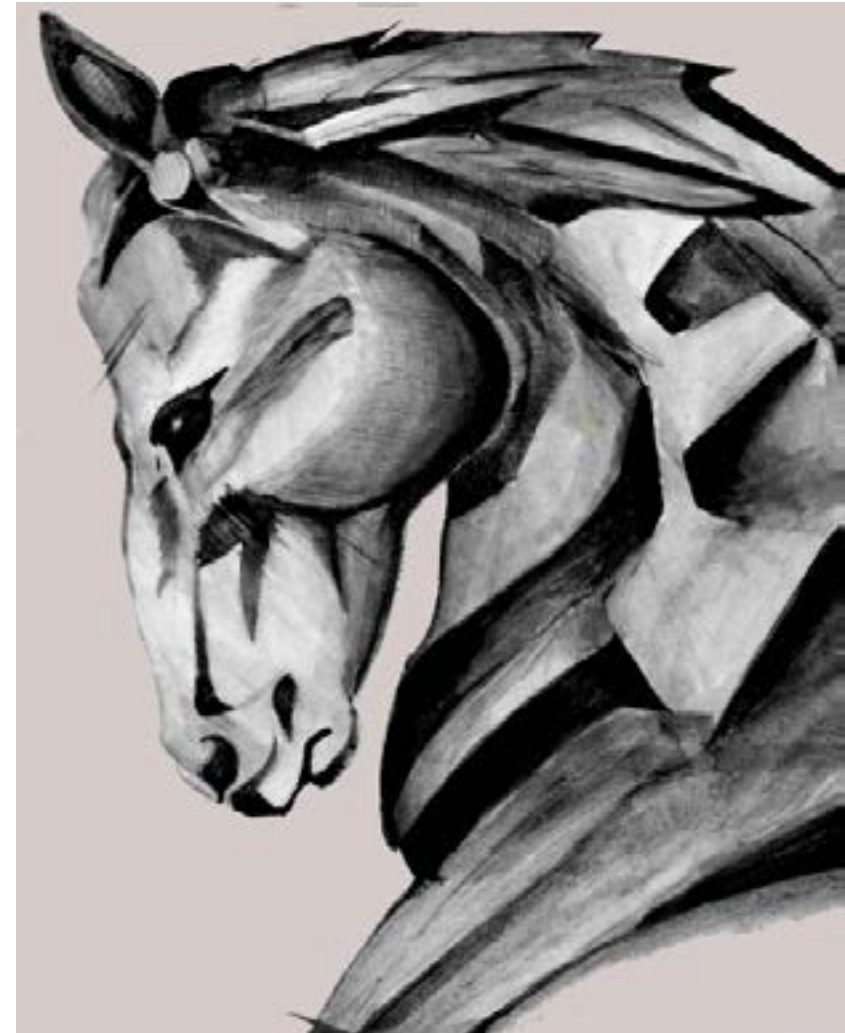
Shomoukh 30x21 cm Mixed media

The beauty of the Arabian horse in its glory (Shomoukh) which refers to authenticity and nobility as Arabs characteristics.