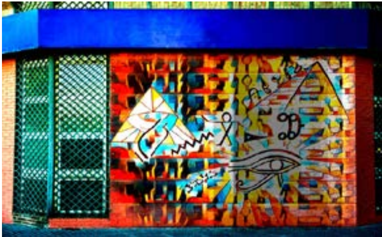
Uniting the Ancient Scripts Street art Digital

The concept behind this street art is uniting the various different historic civilizations into one graffiti and showing the people who are passing by the street; the strength that history holds. It includes Roman, Greek, Egyptian elements and some ancient scripts that say "Unity" combining five different script letters. Different from each other in so many aspects yet inspiring the modern age with all their elements and artworks.