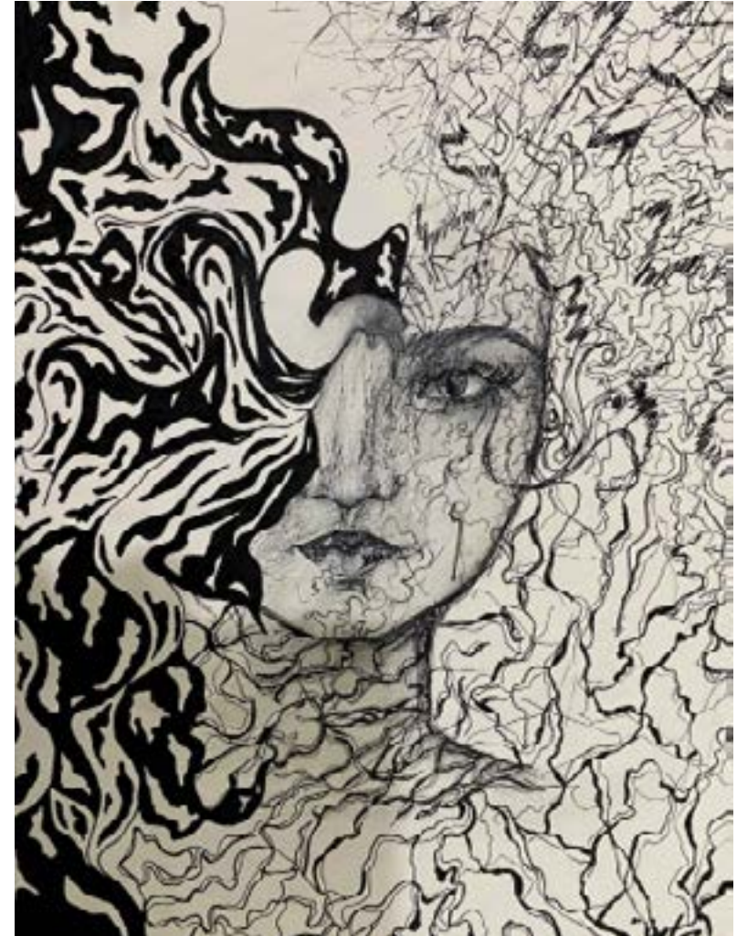
Conflict 30x21 cm Ink on paper

Sometimes a person's biggest enemy is its self. And it is supposed to show the conflict that can happen to a person when in that moment.>>>>>