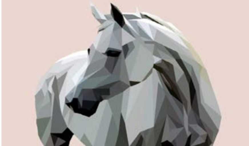
White horse 30x42 cm Digital Art

For this artwork I was inspired by my favourite animal; the horse. Horses and horse riding have been a big passion of me since I was a little girl and I started horse riding when I was 6. I'm an interior design student and I wanted to do an artwork that combines my love for minimalism as well as the beauty of the horse. I came up with this cubistic artwork of a black and a white horse.