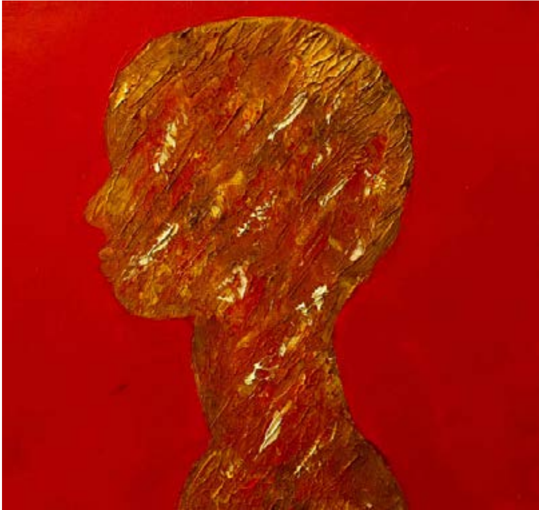
Sophisticated 30x30 cm Oil on canvas