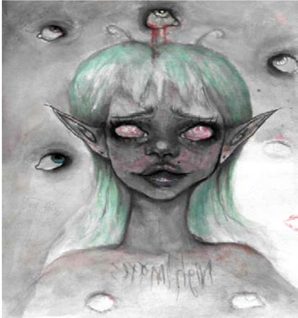
Shades of silence 2 30x21 cm Mixed media on paper