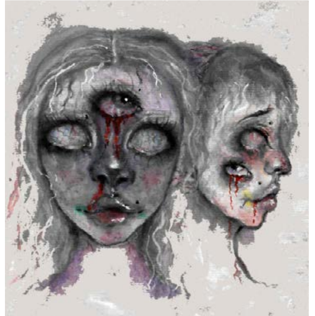
Shades of silence 3 30x21 cm Mixed media on paper