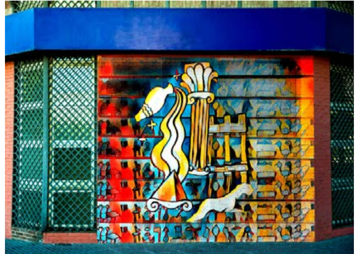
Globalization Of History Street art Digital

The concept behind this street art is uniting the various different historic civilizations into one graffiti and showing the people who are passing by the street; the strength that history holds. It includes Roman, Greek, Egyptian elements and some ancient scripts that say "Unity" combining five different script letters. Different from each other in so many aspects yet inspiring the modern age with all their elements and artworks.