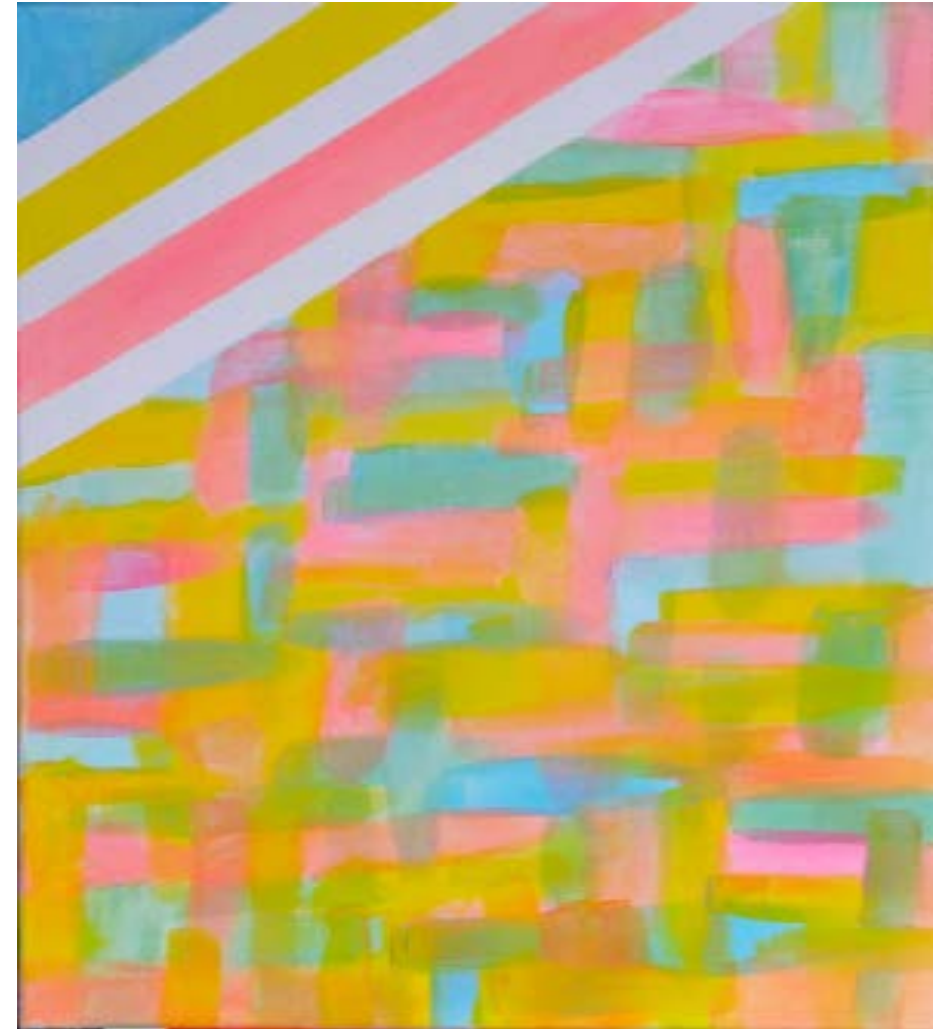
Vibrant and feminine

Geometric shapes are not represented in nature, they are man made. Geometric art is often a vibrant and colorful portrayal of shapes in a unique way. Geometric artworks are often made by organized people who strive for order, usually geometric shapes expresses comfort and efficiency.