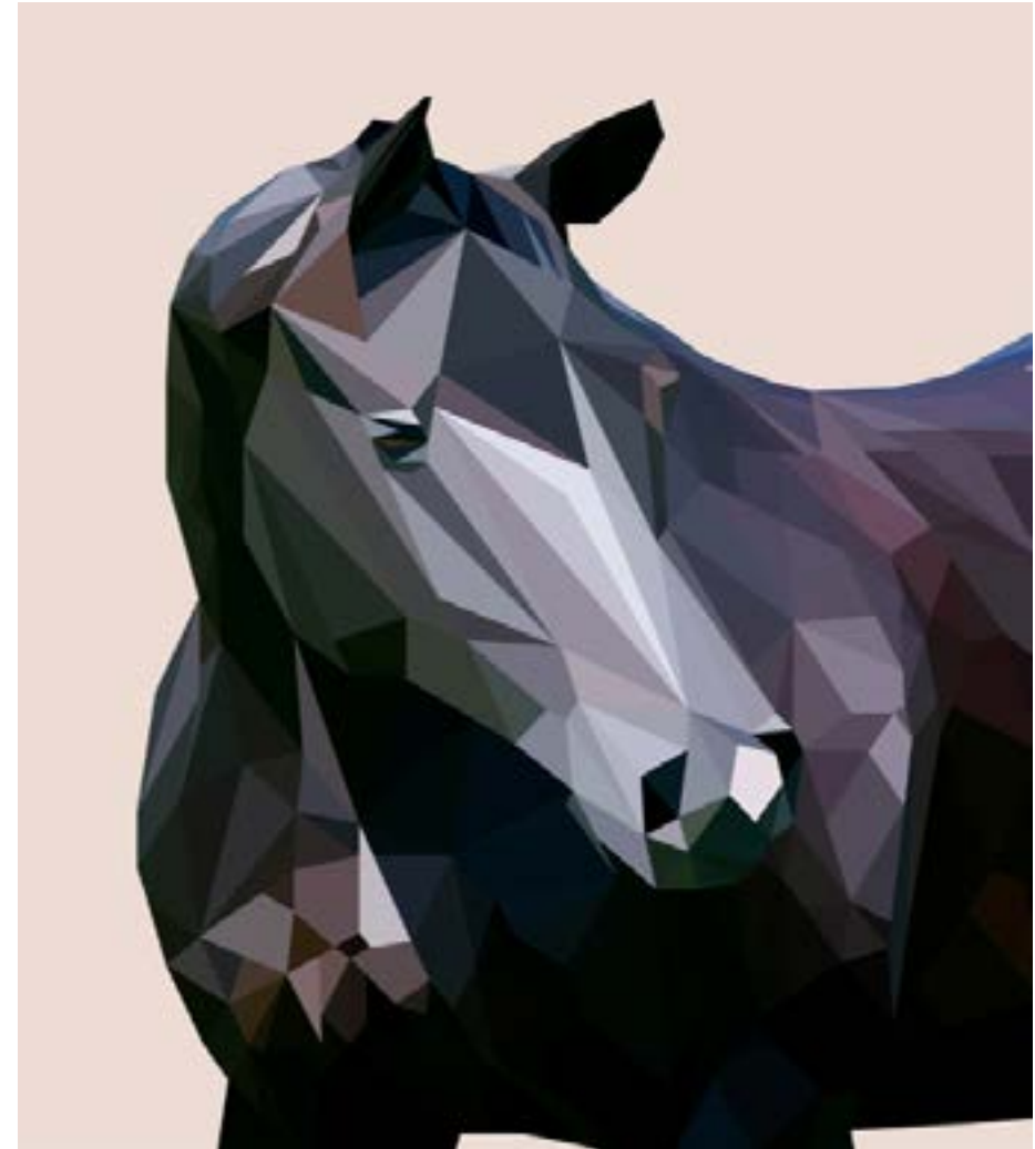
Black horse 30x42 cm Digital Art

For this artwork I was inspired by my favourite animal; the horse. Horses and horse riding have been a big passion of me since I was a little girl and I started horse riding when I was 6. I'm an interior design student and I wanted to do an artwork that combines my love for minimalism as well as the beauty of the horse. I came up with this cubistic artwork of a black and a white horse.