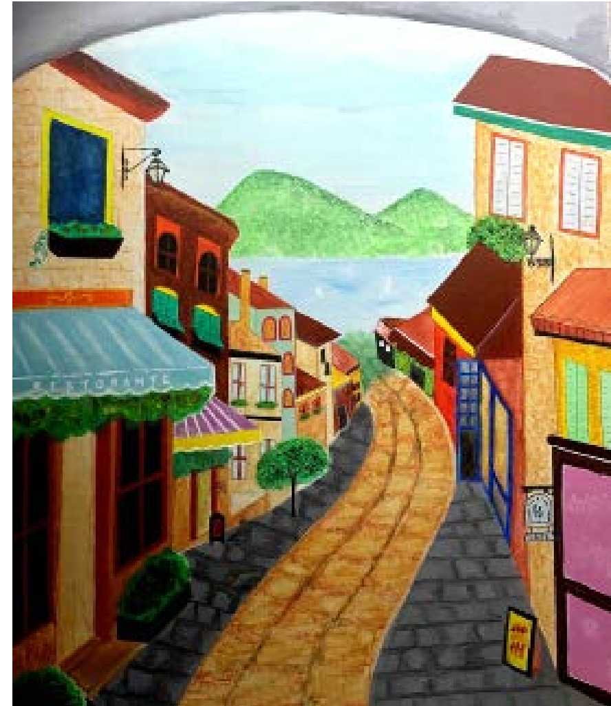
The perspective of a youth

A child's sight is something I have always been fascinated about. Their thinking and interpretation is much simpler to that of a matured person. The main portrayal in the painting is to show the innocence of a child's vision. Children have a tendency to have a more intuitive outlook on life and its like getting the raw instincts of a picture without any biases. We as responsible people, need to maintain this aura for them with the aim that they expand their knowledge based on these pure instincts only!