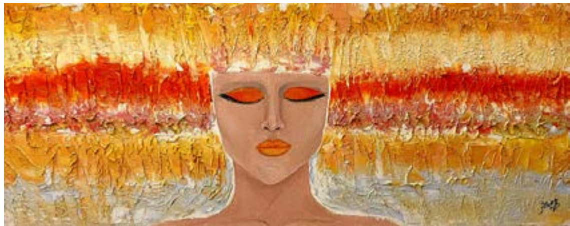
Adaptation 70x30 cm Oil on canvas

Portraits representing heavenly souls on earth. And what happen to these souls once they contact with hellish souls, they start the journey of suffering.