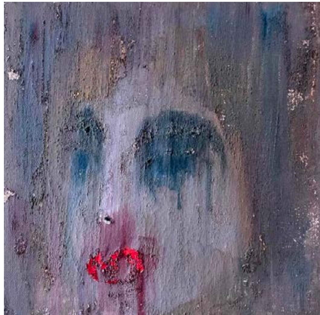
The face Inside My Mind 30x30 cm Acrylic on canvas

From Asperger's to Attention Deficit Hyperactivity Disorder, Generalized Anxiety Disorder, Obsessive Compulsive Disorder, Major Depressive Disorder, all have come in honor for an inherited Post-Traumatic Stress Disorder along with frequent emotional outbursts, all have manipulated, distorted, falsified myself, trickered and often ghosted feelings have crawled up and by miracle .. I didn't take my life away! Depression is a pure devil, it's a satanic parasite eats up the mind of their hostesses. On my journey to recovery, I was really consumed by the idea of normal, but I've learned through my journey to recovery is that it's not discrete never absolute, there is not only black, there are shades of black! Nothing is absolutely right nor wrong, every entity everything everyone every feeling every illness has its own unique, non mutual, non reciprocal meter. Being that, I've learned to accept my brain wiring, I've learned to compete with it, step outside of myself and just look at me from afar, "I can see you there, you are strong, beautiful, persevered, disciplined, but you were trying to survive, it's okay, give me more time"