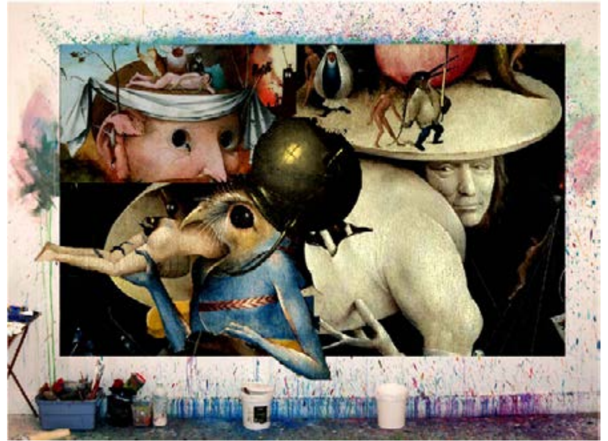
Street art with Hieronymus Bosch

This artwork is composed of the famous paintings by a renowned artist of Renaissance Civilization, Hieronymus Bosch. It shows the concept of using historic paintings and using it in an entirely different contemporary way such as street art, and giving it a new modern context. This artwork honours his work decorating a city wall.