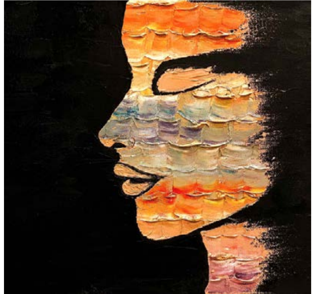
Motion Aftereffect 30x30 cm Digital Art