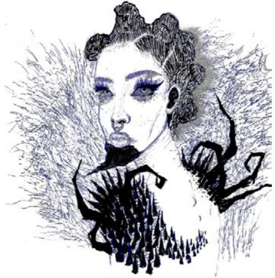
Beauty meets beast

This woman began to lose her softness and her sparkle due to an indecent, growing rough edges that combines her beauty with a devilish instincts that slowly growth on her making her more of a two, a beauty and a beast.