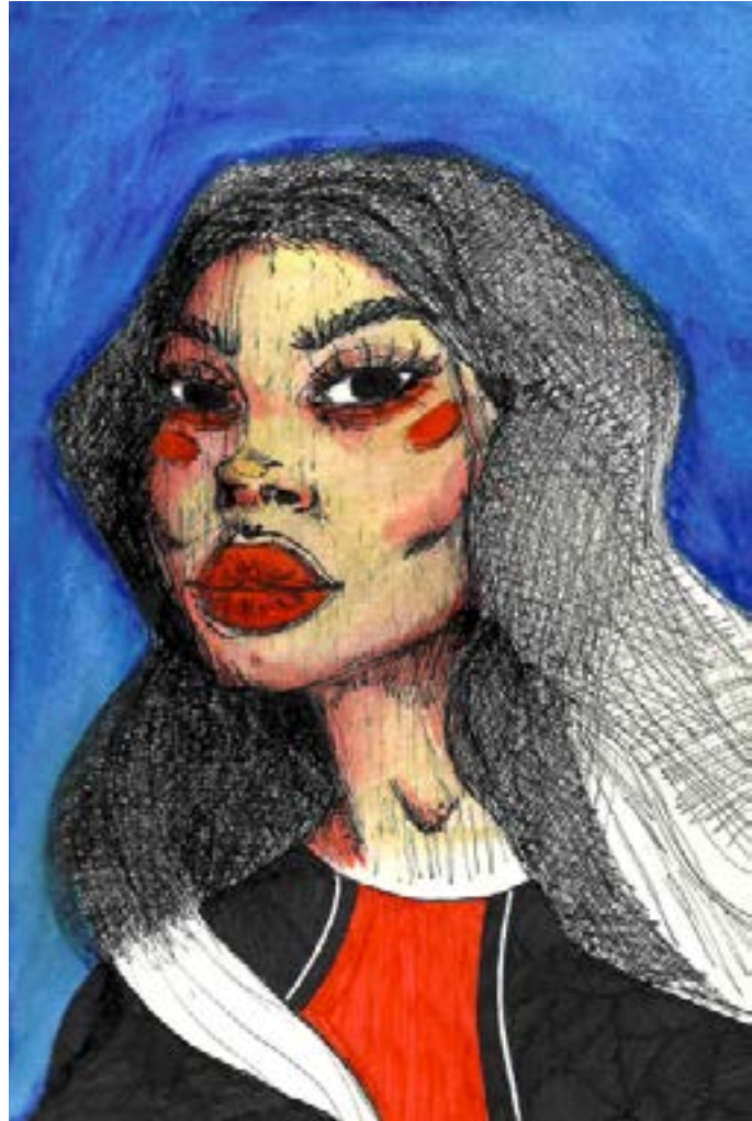
Eva in blue 20x13 cm Watercolor, pencils and ink

Eva is an insecure girl who holds jealousy in her eyes, everything around her seems blue and boring she seeks nothing but to be complete.