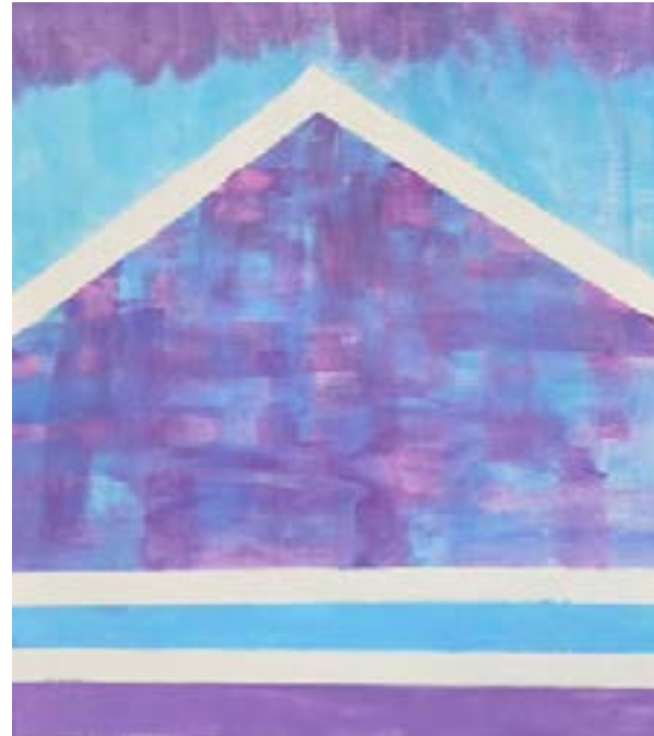
Growth and balance